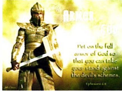
EITHER WE SERVE CHRIST OR SERVE SATAN ...

serve Christ in any way and every way we can. But sad to say, we take this chance for granted and don't use it to serve Him. Many of us still have not realized what serving Christ really is. If we did, either we just really didn't