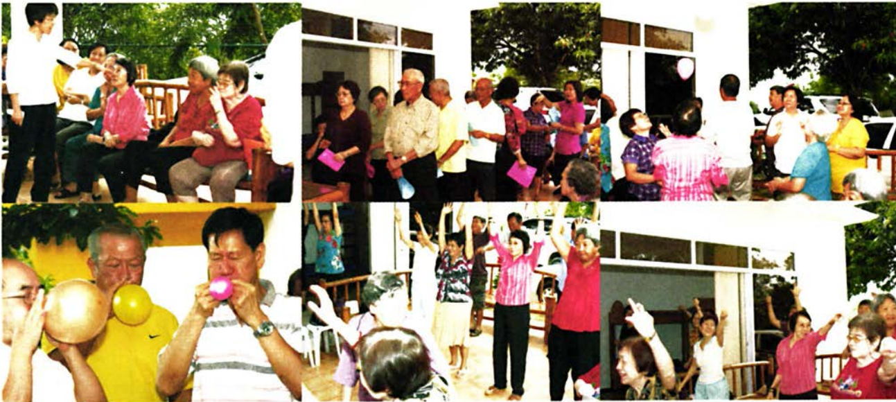
THE GLORY OF YOUNG MEN IS THEIR STRENGTH. BUT THE SPLENDOR OF OLD MEN IS THEIR GRAY HAIR. PROVERBS 20:29

may follow their footsteps and give glory to our Father in heaven. May God continue to give them wisdom and discernment and continue to be a blessing to others.